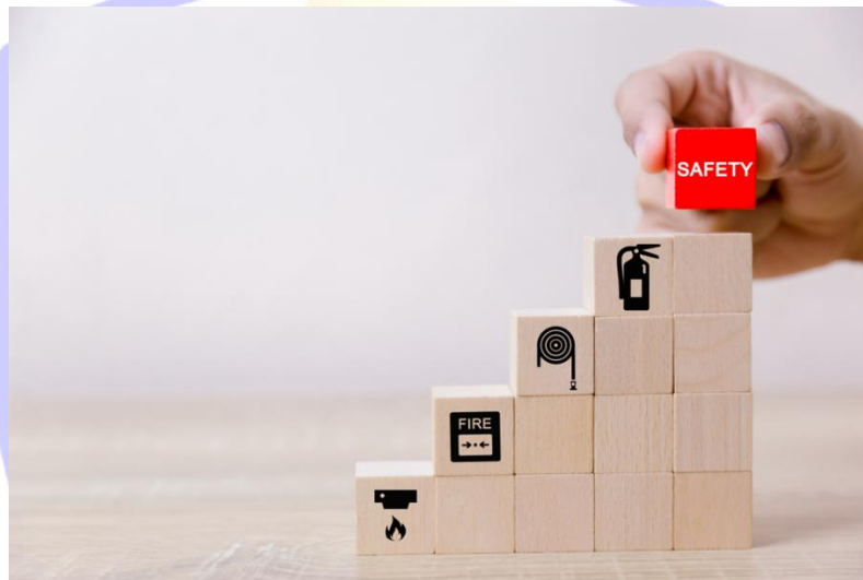
Figure 1: Planning for safe and resilient communities is at the heart of what FireWise delivers. Safe communities depend on a balanced commitment to people, property, and the environment.

FireWise demonstrates a commitment to environmental and social causes by taking steps to become a certified Benefit Corporation in June 2021. We have been certified by a Benefit Corporation for Good (BCfG) to affirm that we qualify. In the following pages of this report, we will detail what FireWise has achieved for the fiscal year 2021 (March 1-February 28) and our plans to continue improving our performance in 2022.