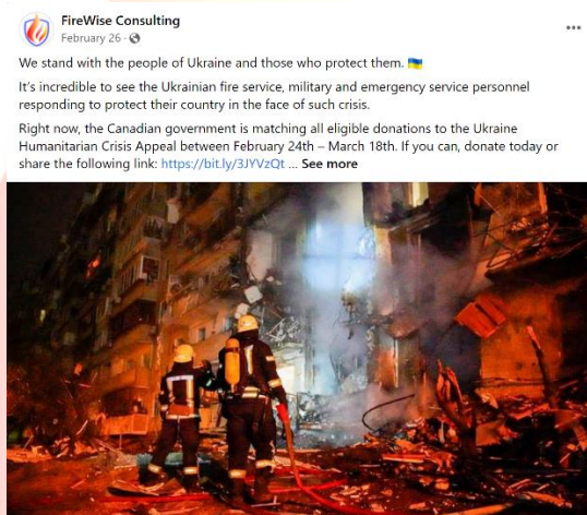
Figure 5: FireWise has a well developed social media capability that we use to amplify voices that need to be heard. In this case drawing attention to the opportunity to support Ukraine and the Government of Canada's matching funds.

March 8, 2022 - FireWise donated $500 to the Red Cross Ukraine Humanitarian Crisis Appeal. At the time, the Canadian government was matching all eligible donations.