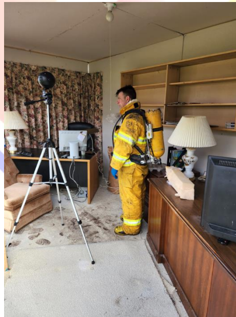
Figure 2: For FireWise, our people are the heart of the organization.