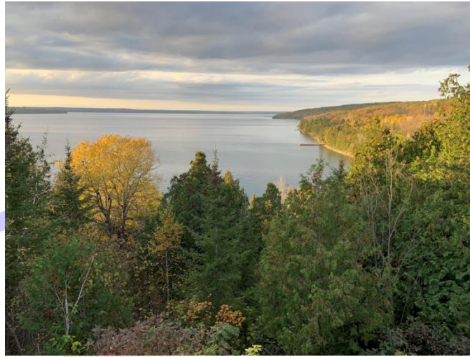
Figure 3: We understand the essential requirement to protect our environment from damage and destruction. FireWise is working hard to reduce the impacts of our business through innovation!

In our pursuit to become a more environmentally sustainable organization, FireWise is determined to lead the industry to new and innovative training solutions. While most of our training is delivered in an online format, we currently offer in-person practicums, including live-fire burns. FireWise strives to be at the forefront of our industry and is currently working towards moving these live-fire burns to be delivered in an online format through the use of Virtual Reality (VR) technologies.