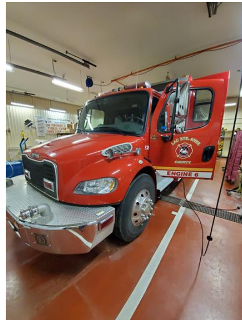
Figure 4: Community safety is a team sport. We all need to work together!

Our guiding principles include working collaboratively with other organizations that share our values. We look to be a place of education and provide many free resources to individuals and organizations to foster industry-wide growth. We continue to deliver FireWatch, our free monthly e-Newsletter, to share global stories and broaden our perspective as an industry.