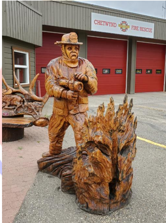
Figure 6: The path to the future starts with our past. FireWise recognizes the importance of respecting history and culture, but not to be constrained by it.