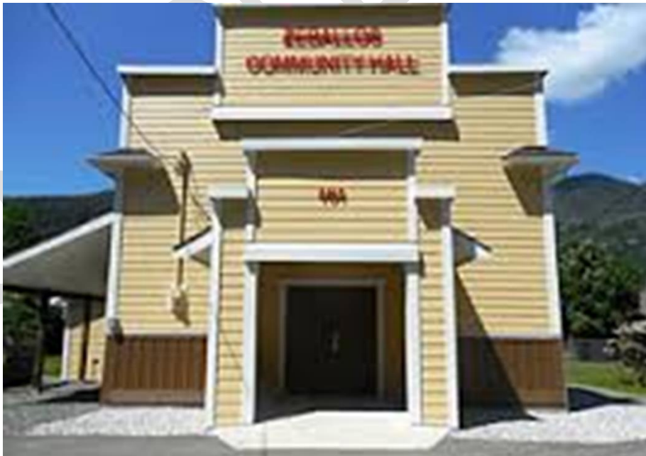
PHOTO OF YOUR BUILDING HERE

IF YOU REQUIRE A COPY OF THIS DOCUMENT IN WORD PLEASE EMAIL mailto:info@firewiseconsulting.com